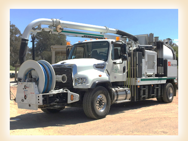
VAC-CON – Sewer Pipe Cleaning Truck

District crews hydro-clean the Sewer Main pipes using a high pressure water jet and vacuum combination cleaner (Vac-Con).