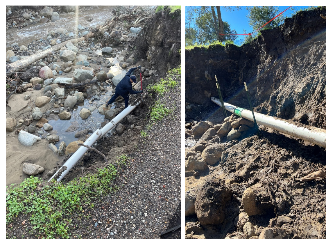
Project 3: Creekbank Restoration – Pipe L333-7